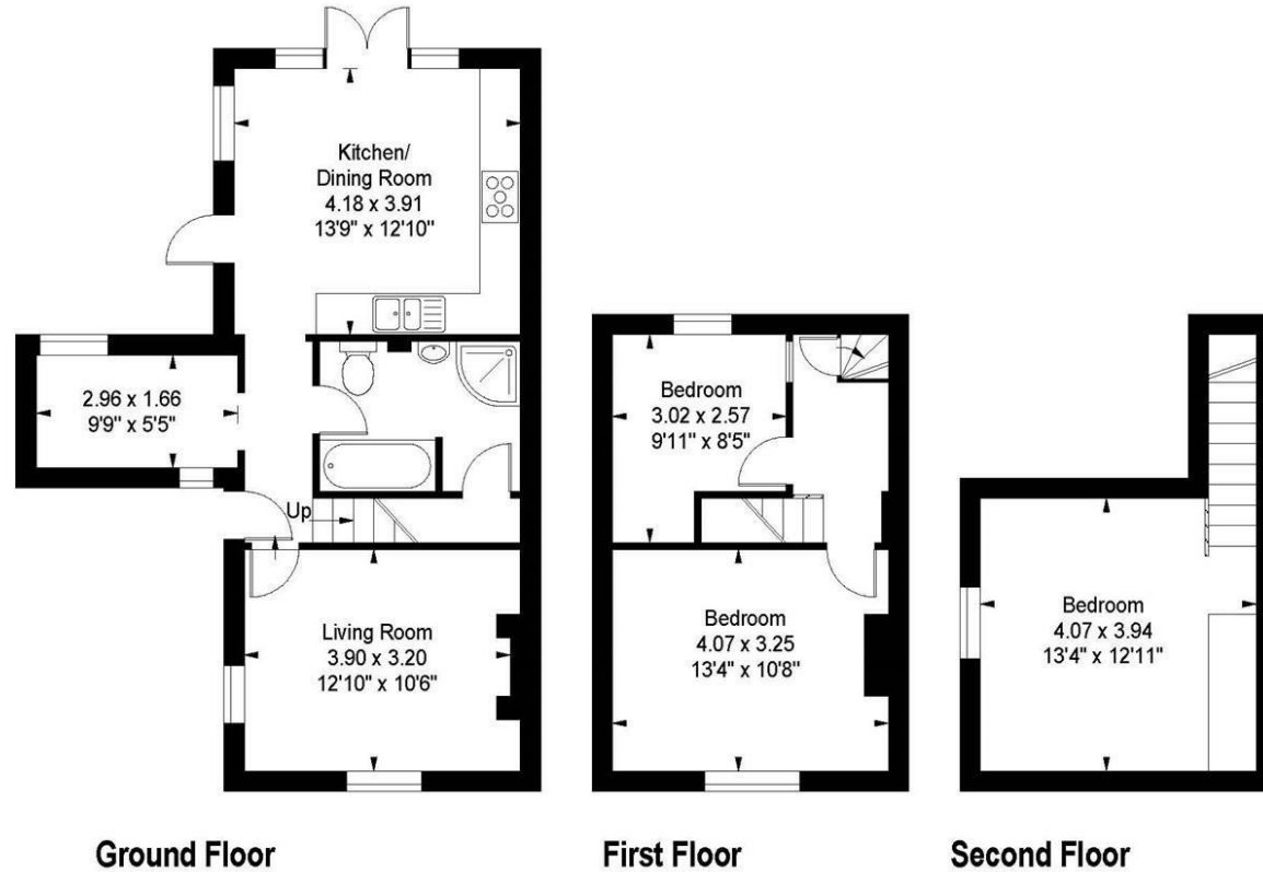
Illustration for identification purposes only. measurements are approximate, not to scale. floorplansUsketch.com c (ID875399)

Approximate Gross Internal Area = 981 Sq Ft / 91.13 Sq M